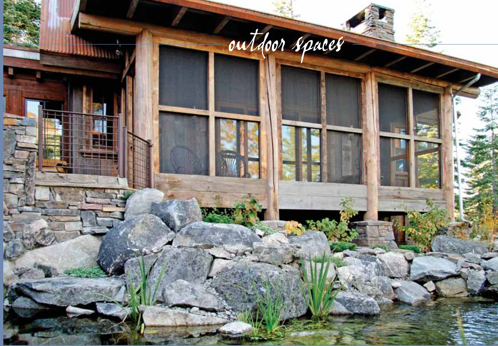
DURING SUMMER, THE SCREENED-IN PORCH OF THE GUEST QUARTERS FILLS WITH THE MUSIC OF THE ADJACENT CREEK (LEFT). THE FRONT OF THE HOME (BELOW) FEATURES A SUMMER-PERFECT FIRE PIT.