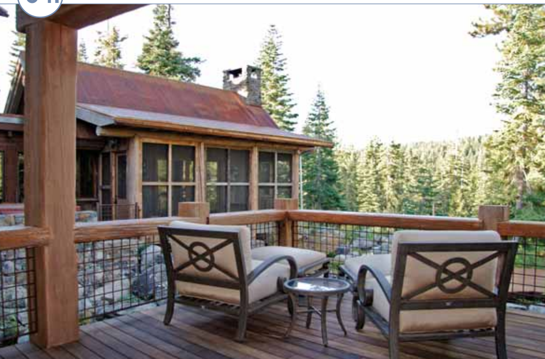
THE BACK DECK (ABOVE) OFFERS CREEK-SIDE LOUNGING OR A PERFECT PERCH FOR FLYFISHING. THE PONDS AND STREAM (BELOW) ARE MODELED ON SHIRLEY CREEK IN SQUAW VALLEY AND SO SKILLFULLY ASSEMBLED THAT THEY ARE PRACTICALLY INDISCERNIBLE FROM THE REAL THING.